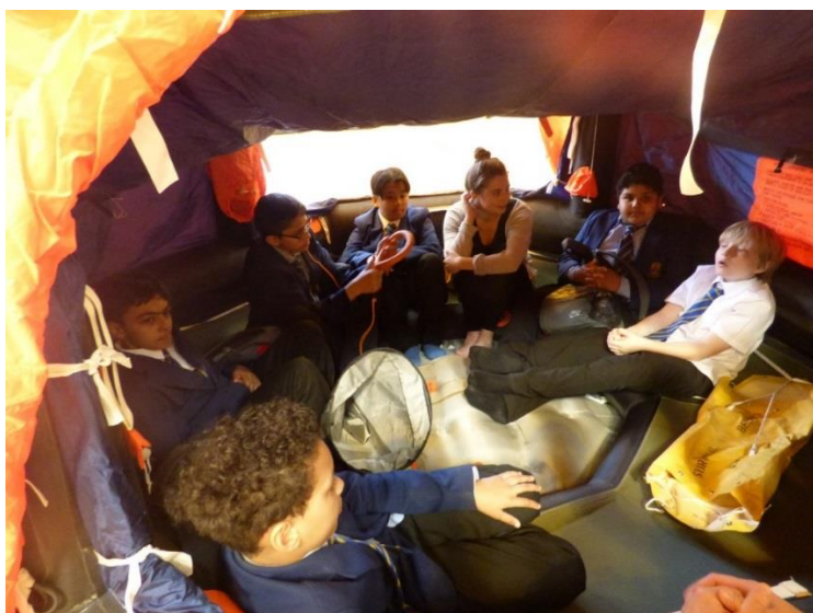
Waiting for their turn in a RAF life raft