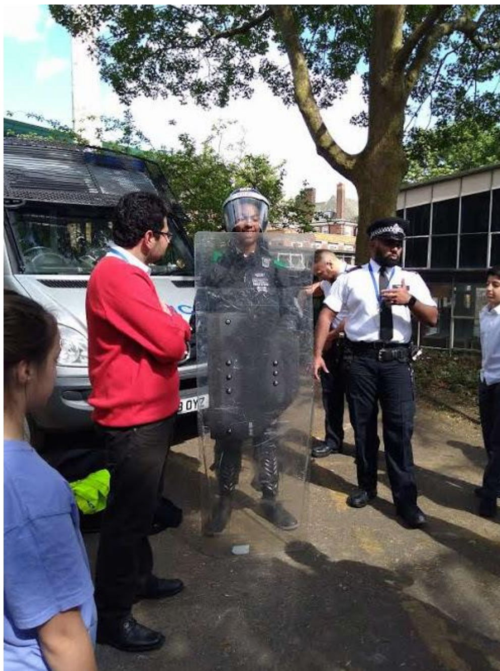
WES Police Cadet tries out riot gear in WES car park