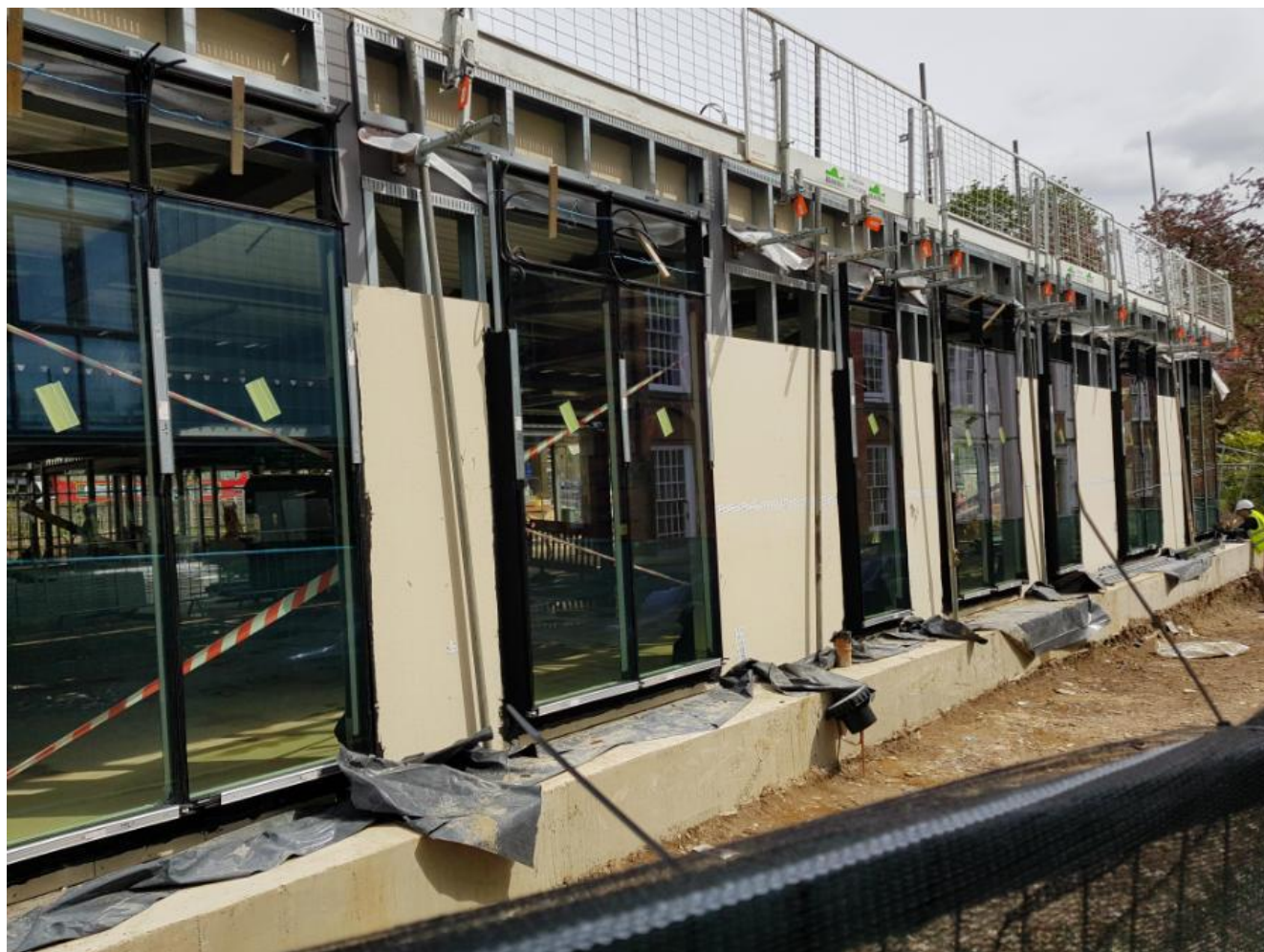
LaSWAP Building takes shape