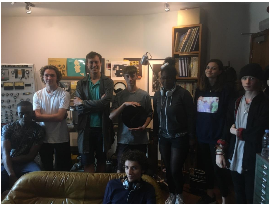
Sixth Form Trip to Gearbox Records – Kings Cross

The Music Department has their own newsletter, which can be found on the school website. There has been the usual full programme of events with two Performance Platform concerts where instrumental music students have performed a variety of solo and small ensemble pieces informally in front of an audience of parents and staff; the LaSWAP concert and a brass concert with Gospel Oak on the Heath bandstand. One highlight for the Year 12 Music Tech students was a trip to Gearbox Records in Kings Cross.