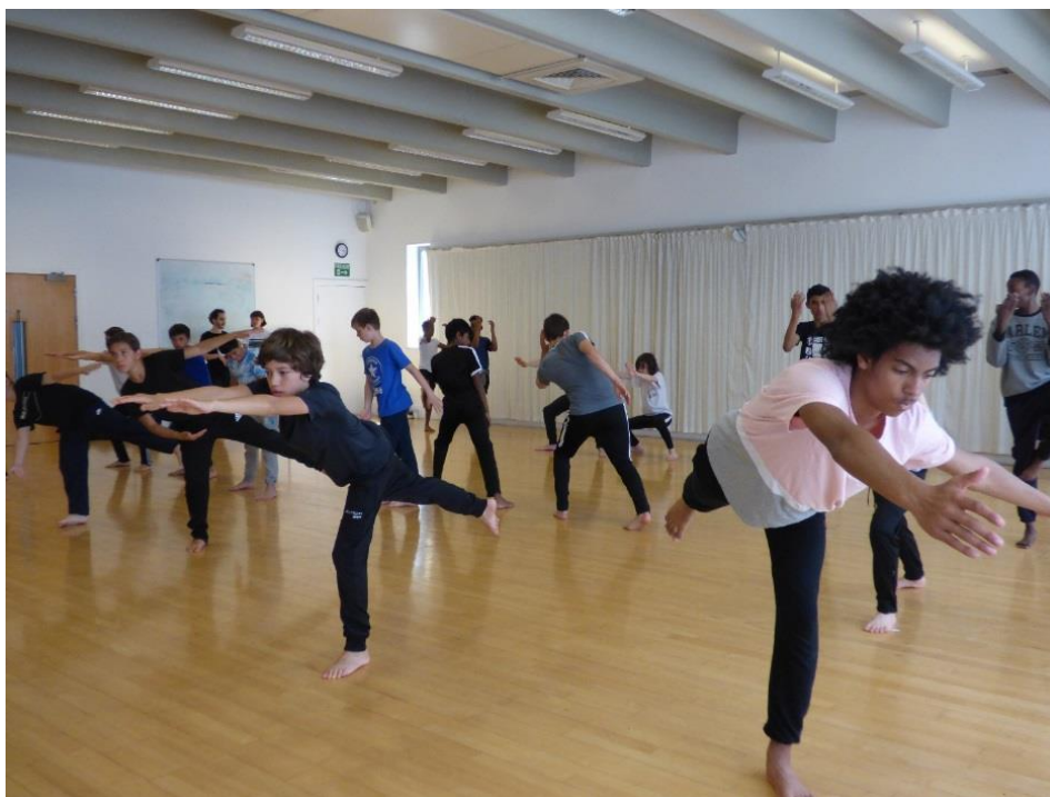
Boys from years 7, 8 and 9 take part in a Tavaziva workshop at the Place in May