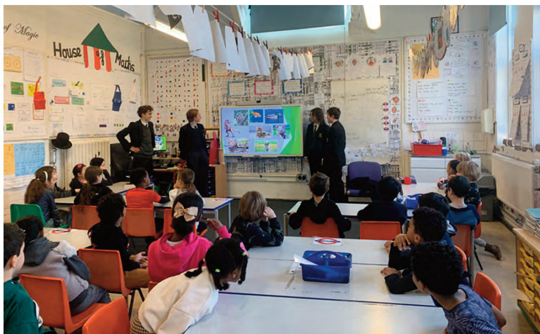
WES students teaching in a local primary school

No two days are the same at WES, but for me they always start with the same thing, coffee! Most of my time