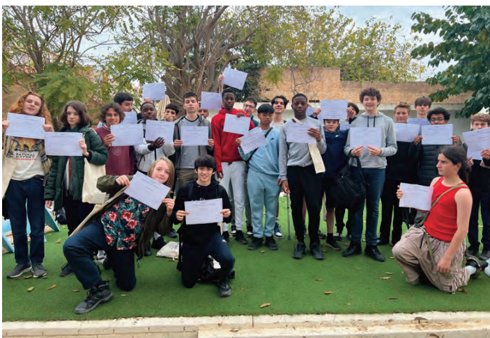
Our Escuela la Playa group with their course certificates