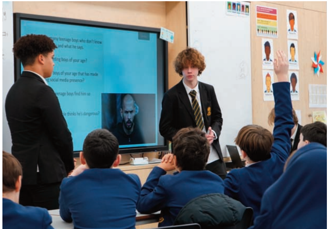
Year 11 mentors running workshops for Year 8 students

We've worked with a number of organisations such as the Violent Crime Prevention Board, Barnet Mencap and Solace, embedding partnership projects into the curriculum to help our students learn about important social justice issues as they