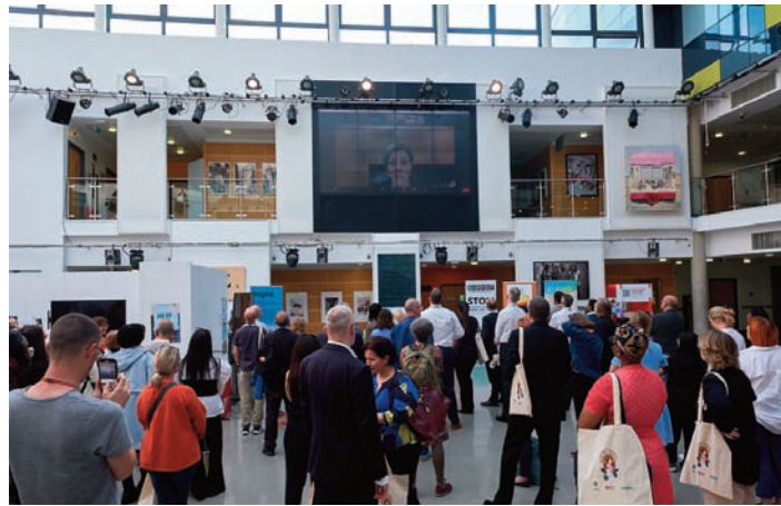
The WES 'Counter Don't Cancel' documentary being showcased at Middlesex University

This was the name of the workshop and indeed I think this was absolutely the right way to go when talking to the boys. Finding ways to present alternative perspectives, to