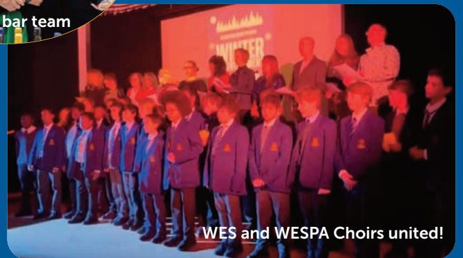
WES and WESPA Choirs united!