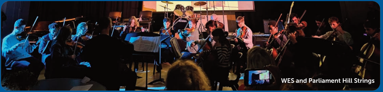
WES and Parliament Hill Strings