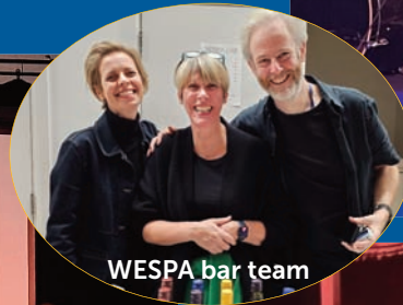
WESPA bar team