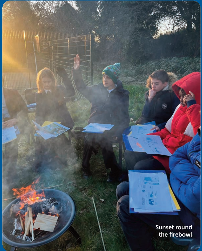
Sunset round the firebowl