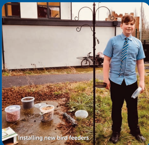
Installing new bird feeders