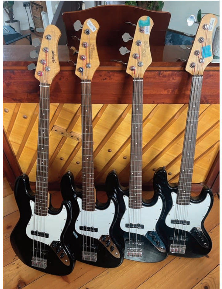
Below: Recent donation of art supplies.