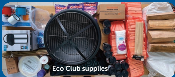
Eco Club supplies