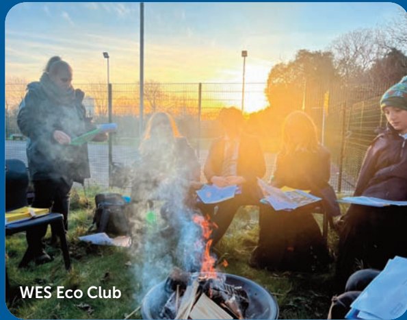
WES Eco Club