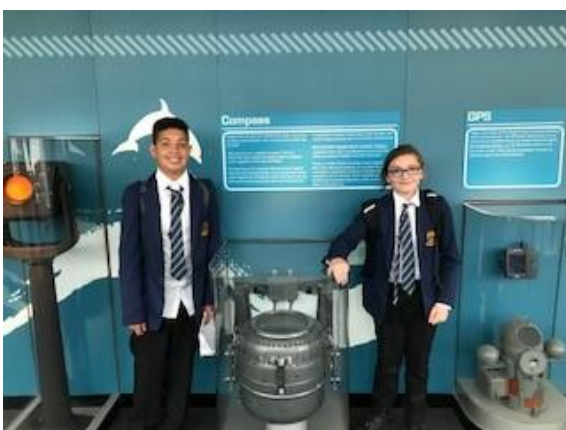
Having a closer look at the navigation tools of a ship