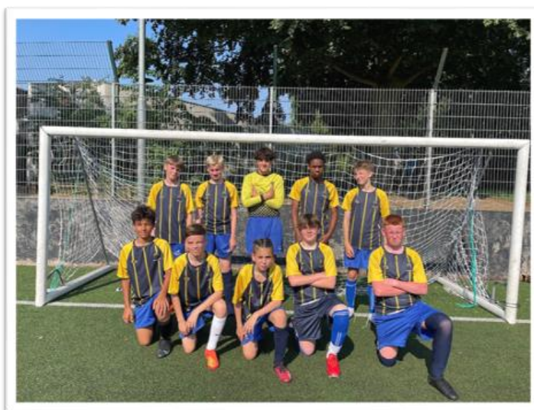
Me on WES School Football Team 2023, end on left, back row.