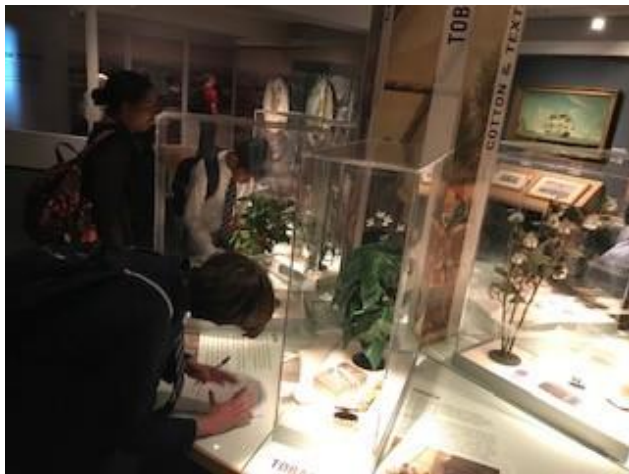
Students researching the raw materials which East India Company traded in the 19 th century