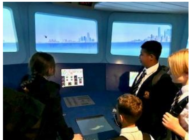
The simulation ship allows you to navigate the vessel applying geographical skills like reading maps and symbols